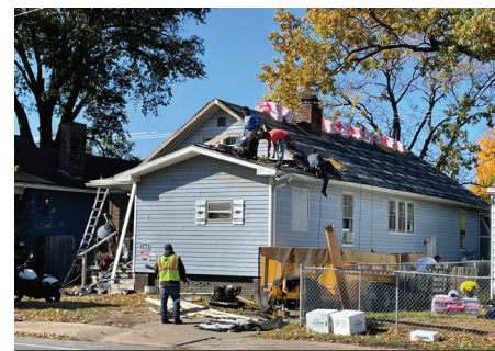
A neighbor receives a new roof