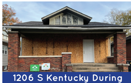
1206 S Kentucky During