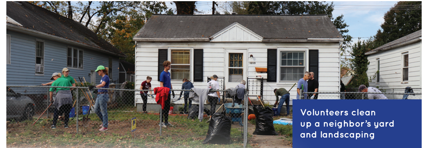
Volunteers clean up a neighbor's yard and landscaping