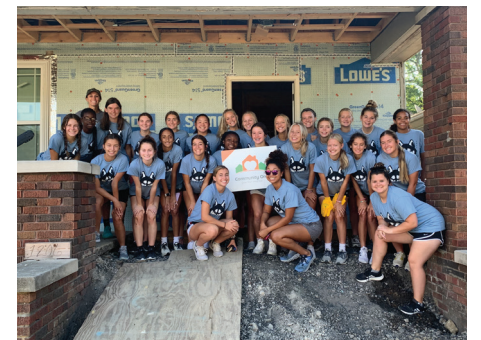
Students from a local high school's girls soccer team served on S Kentucky Avenue

Transforming communities happens one neighbor at a time. Your support is making that possible on S Kentucky Avenue and throughout Evansville.