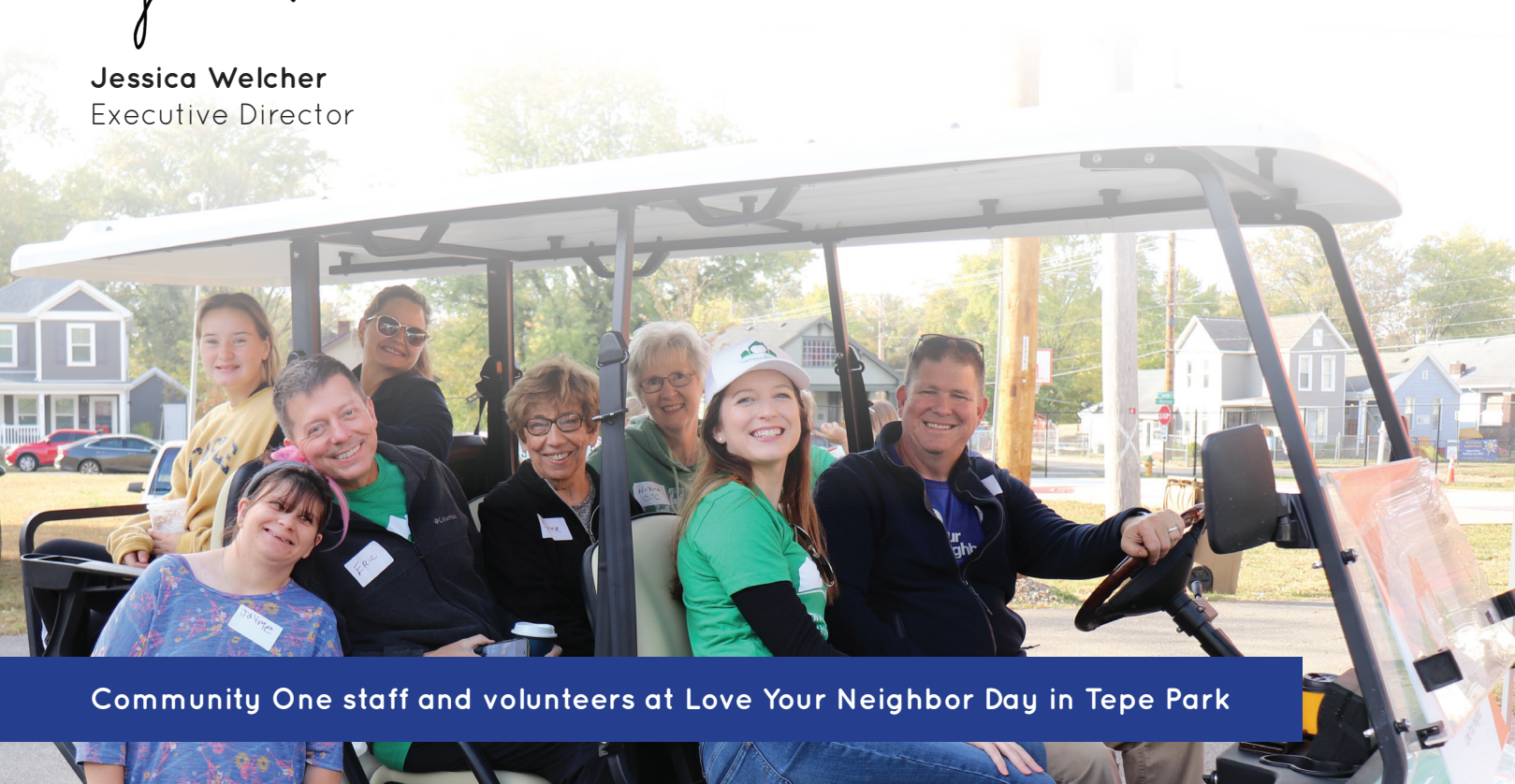
Community One staff and volunteers at Love Your Neighbor Day in Tepe Park