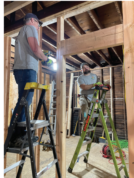
Volunteers restoring the inside of 1206 S Kentucky Avenue