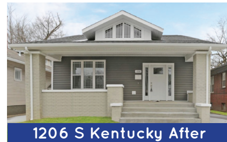
1206 S Kentucky After