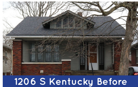
1206 S Kentucky Before